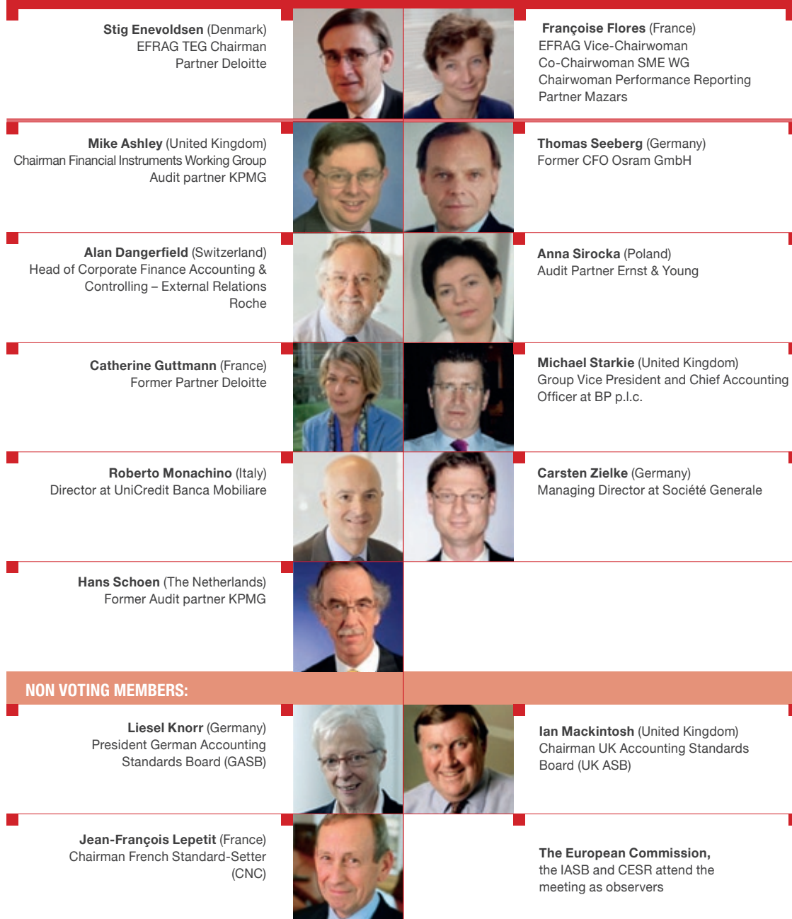
TABLE 3 - TECHNICAL EXPERT GROUP