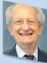
Angelo Casó (Italy) President, Organismo Italiano di Contabilità (OIC)