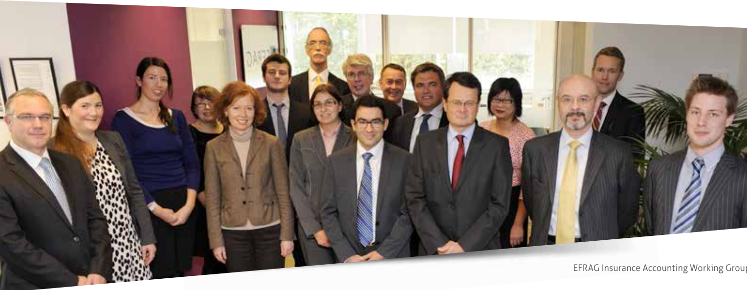
EFRAG Insurance Accounting Working Group