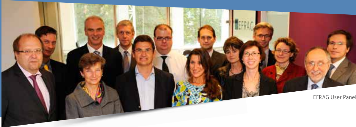
EFRAG User Panel

Users, including investors, play a fundamental role in the development of high quality IFRS. It is therefore essential for EFRAG to have a thorough understanding of the investors' needs in developing its views. EFRAG operates an active User Panel that provides input on a quarterly basis into the EFRAG Technical Expert Group on the most important and topical issues. In 2012, EFRAG's User Panel focused on various aspects of accounting for Financial Instruments as well as accounting for Leases and Revenue Recognition. EFRAG User Panel views were also sought on some of EFRAG's proactive projects in partnership with the European National Standard Setters. This input is crucial for EFRAG.