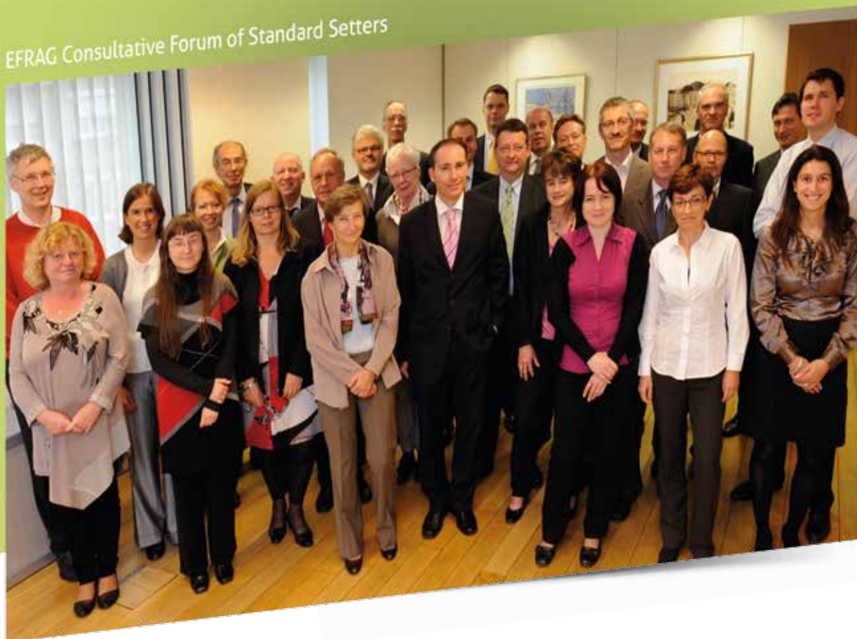
EFRAG Consultative Forum of Standard Setters