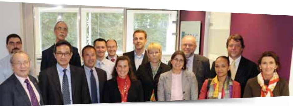
EFRAG Business Model Advisory Panel