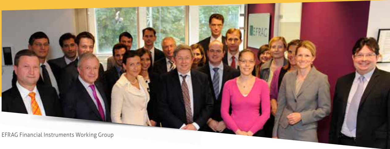
EFRAG Financial Instruments Working Group